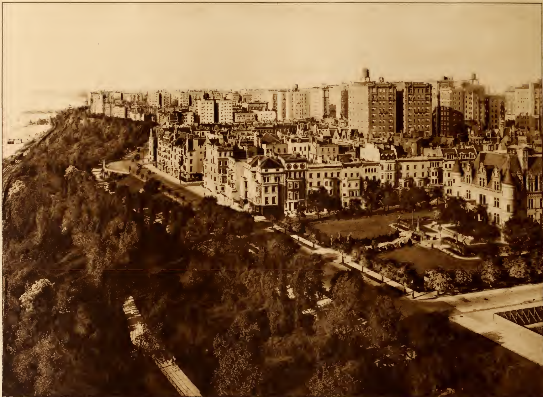
RIVERSIDE DRIVE. One of New York's most attractive and picturesque highways. One side of the thoroughfare is lined with costly residences and handsome apartment buildings. At the right in the picture is the residence of Charles M. Schwab, one of the finest in the city. Grant's Tomb and the Soldiers' and Sailors' Monument are situated here.